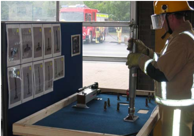
An applicant undertaking the Equipment Assembly test

The equipment assembly is designed to test manual dexterity. Applicants are required to assemble and dis-assemble part of a set of hydraulic rescue equipment following a set of diagrams or photographs. There is a time limit for this test.