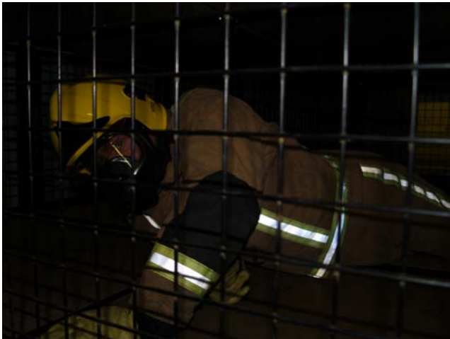
An applicant undertaking the Casualty Evacuation test

The enclosed space test is designed to test for claustrophobia. It is conducted in a BA crawl and walk way and requires applicants to follow a pre-determined route whilst wearing PPE and a BA facemask. Half of the test is conducted with clear vision and half with obscured vision. There is a time limit for this test.