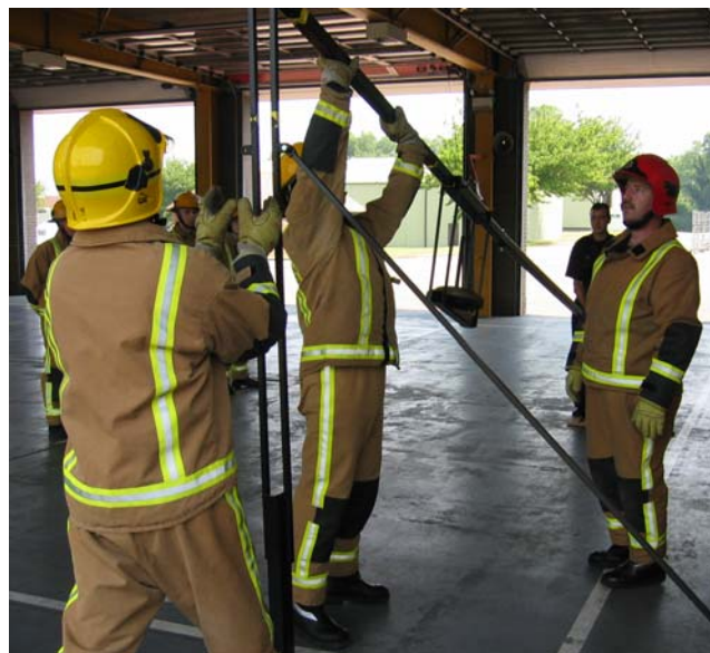
An applicant undertaking the Ladder Lift and Lower Simulation

The ladder lift and lower simulation is designed to test muscular strength, particularly upper body strength. Applicants are required to lift the ladder simulation device from a position 75cm above the ground to 180cm above the ground and then back to the starting position. The test is repeated using weights from 5 to 15kg to simulate the different type of ladder in use with the FRS. There is no time limit for this test.