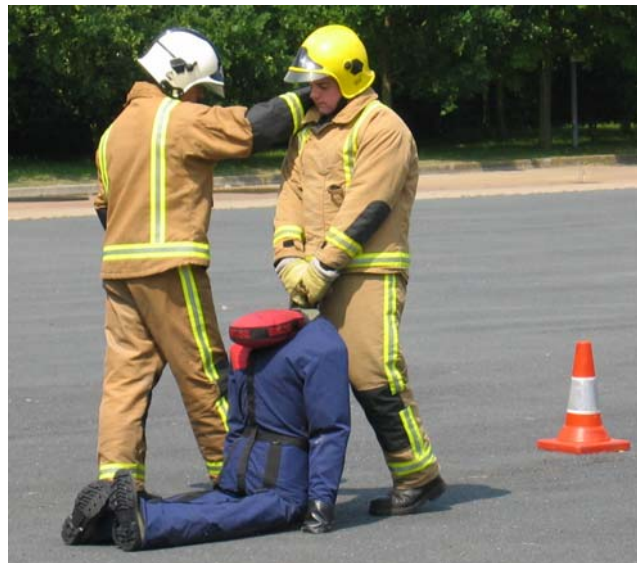
An applicant undertaking the Casualty Evacuation test

The casualty evacuation is designed to test muscular strength and stamina. Applicants are required to drag a 55kg casualty whilst walking backwards around a 30m course. Applicants are guided around the course for safety. There is a time limit for this test.