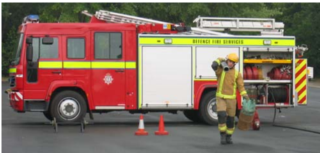
An applicant undertaking the Equipment Carry test

Applicants will be prompted if necessary but must complete the test in the correct order. There is a time limit for this test.