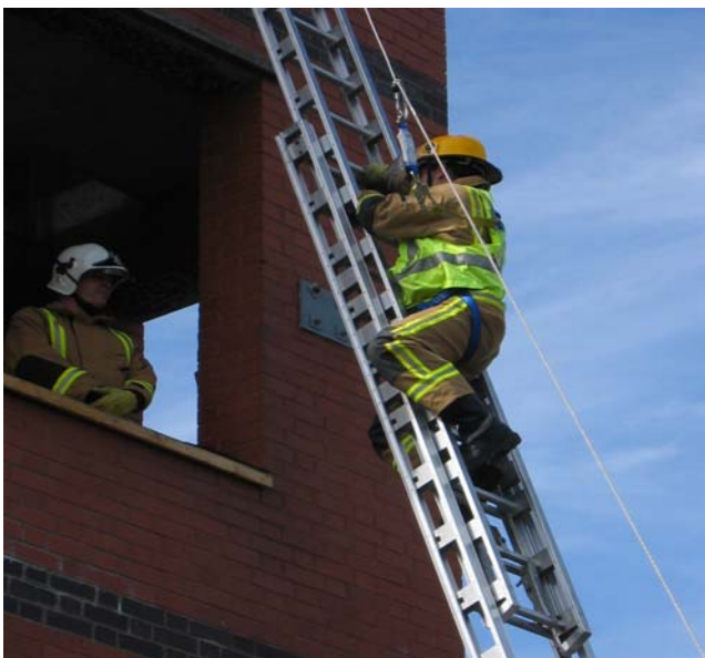
An applicant undertaking the Ladder Climb test

The ladder climb test is designed to test for confidence at heights. It requires applicants to climb approximately two thirds of the way up a 13.5m ladder and take a leg lock. They are then required to lean back, look down and identify a symbol at ground level before descending the ladder. There is no time limit for this test.